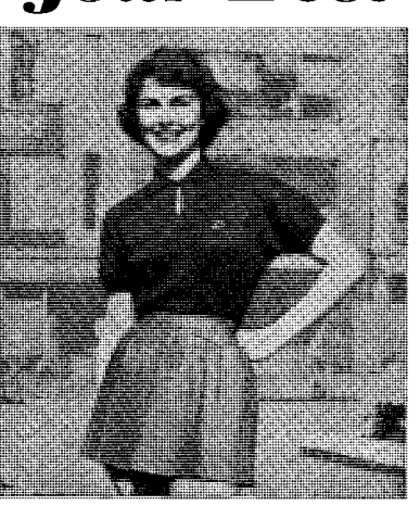
Ladies' shirt and skirt

Men's Sportswear of any description, inspect first the Victor Barna Range made by